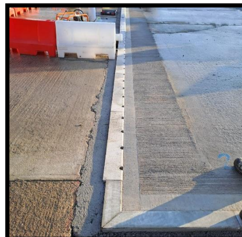
Phase 3A Dancey Road drainage work complete