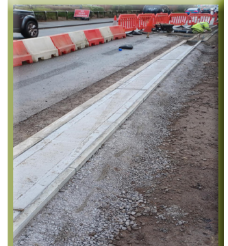
Carriageway kerb & buffer zone in Phase 1B (opposite Tesco)