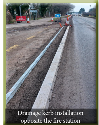
Drainage kerb installation opposite the fire station